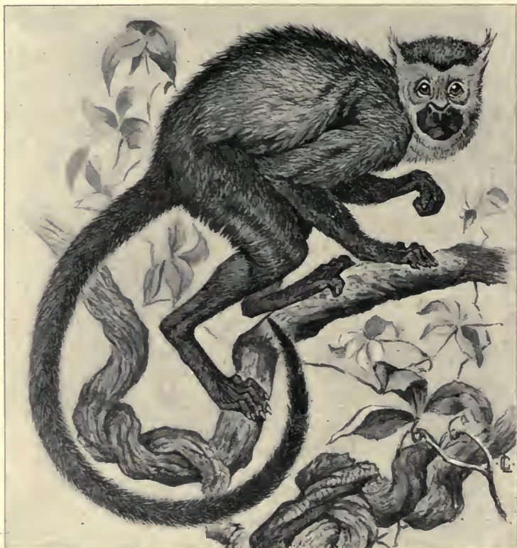
FIG. LXXXIII. SAIMIRI CERSTEDI. CERSTED'S TITI MONKEY.